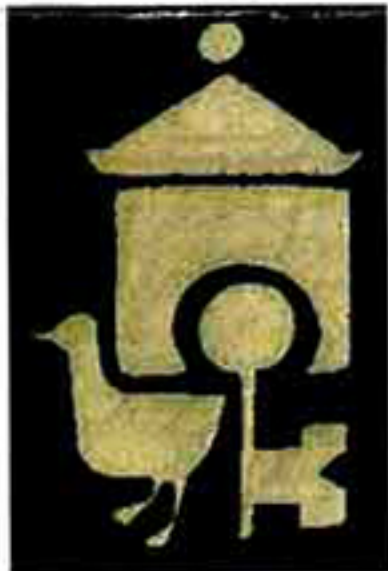
DKPOA LOGO Circa 1969